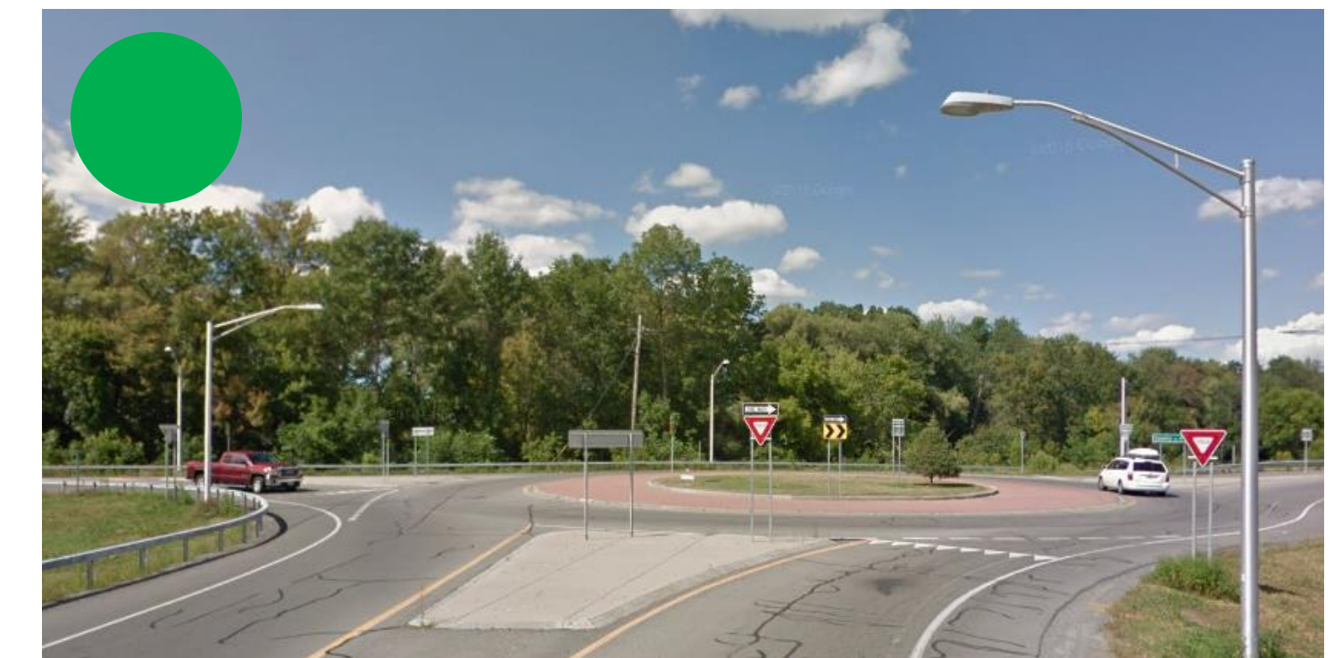
CR 10 at CR 4