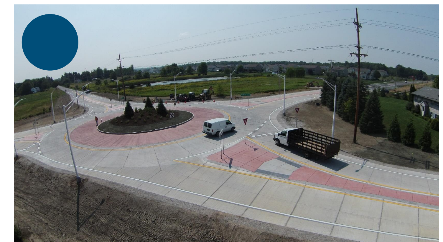
CR 8 at CR 41 and Shortsville Road