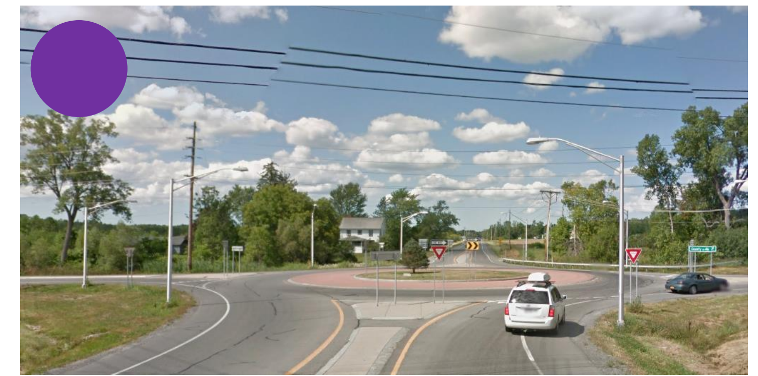
CR 10 at CR 46